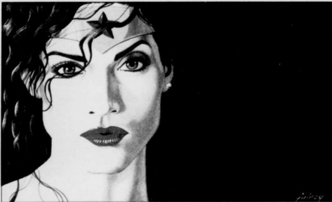
Wonder Woman images, like this one by Paul Gulacy, were up for auction to benefit Portland women's shelters.