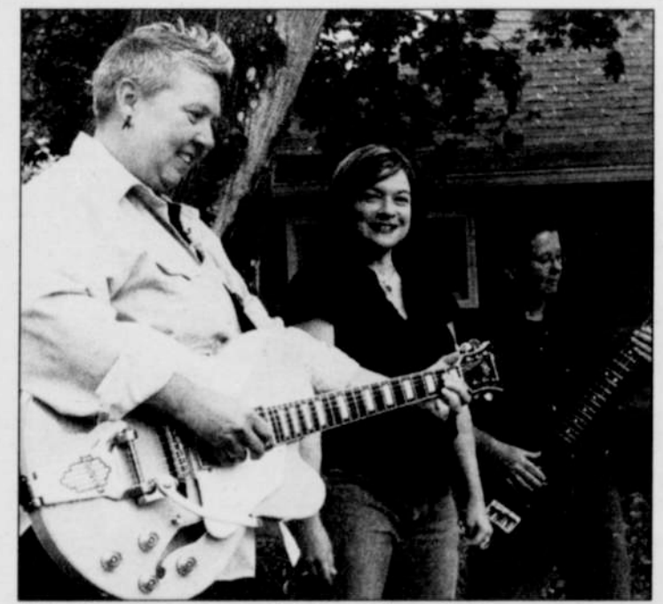
Velvet Tractor performs Oct. 21 at Haven Coffee

Insight Out Theatre Collective presents Leni , the story of German filmmaker Leni Riefenstahl, whose two most famous films, Triumph of the Will and Olympia , were funded by the Nazi Party, through Nov. 11 at the historic Academy Theater. (8:30 pm Thursday-Saturday, 1 pm Oct. 29. 7818 SE Stark St. $15 from 503-493-8070; Thursdays are $5-$15 sliding scale.)