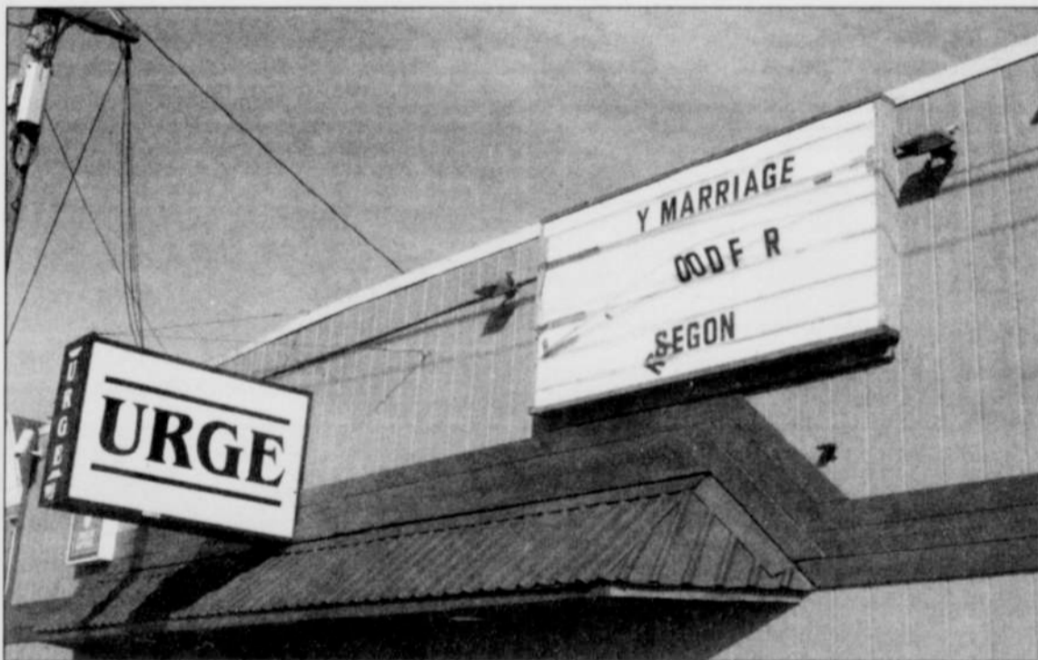
Police suspect homophobes are to blame for vandalism at Urge on North Lombard Street.