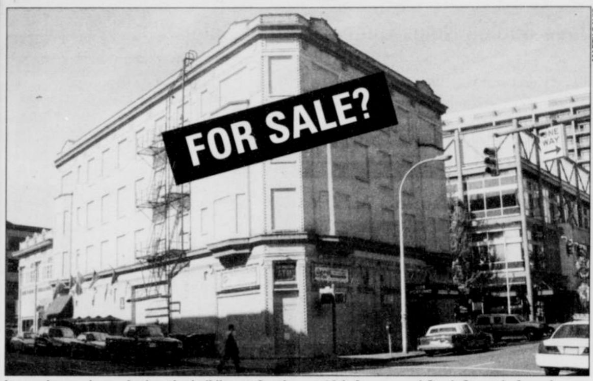
It remains unclear whether the building at Southwest 12th Avenue and Stark Street is for sale.

Stark Sale Unclear It remains a mystery whether the building at Southwest 12th Avenue and Stark Street, housing Burnside Triangle anchors Club Portland and Silverado, is on the market.