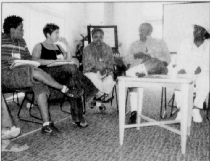
Attendees of Western States Center's Women and Trans People of Color Gathering reflect on common experiences.

Staff and leaders of grassroots community-based organizations from across the region gathered from Aug. 11 to 13 at Reed College for Western States Center's Community Strategic Training Initiative.