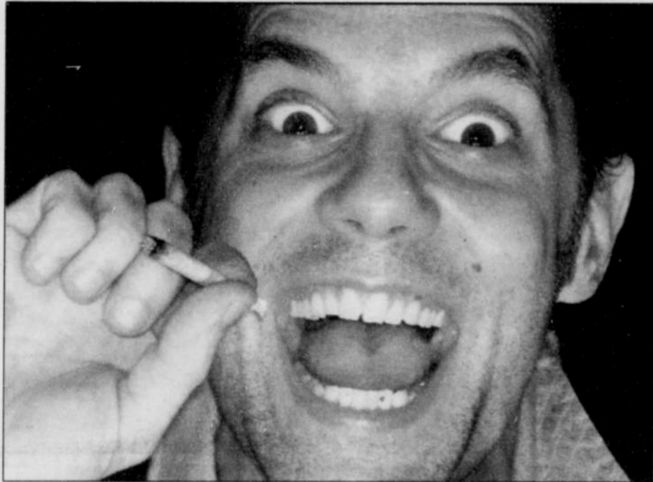
A fresh-faced high schooler falls prey to an evil marijuana peddler in Stumptown Stages' Reefer Madness , opening Sept. 8.

Womyn are invited to help choose art for the 2008 datebook and calendar during the We'Moon Weaving Circle at Full Circle Temple. (1-5 pm. 3125 E Burnside St. RSVP to Kate 503-630-7848 or kate@wemoon.ws.)