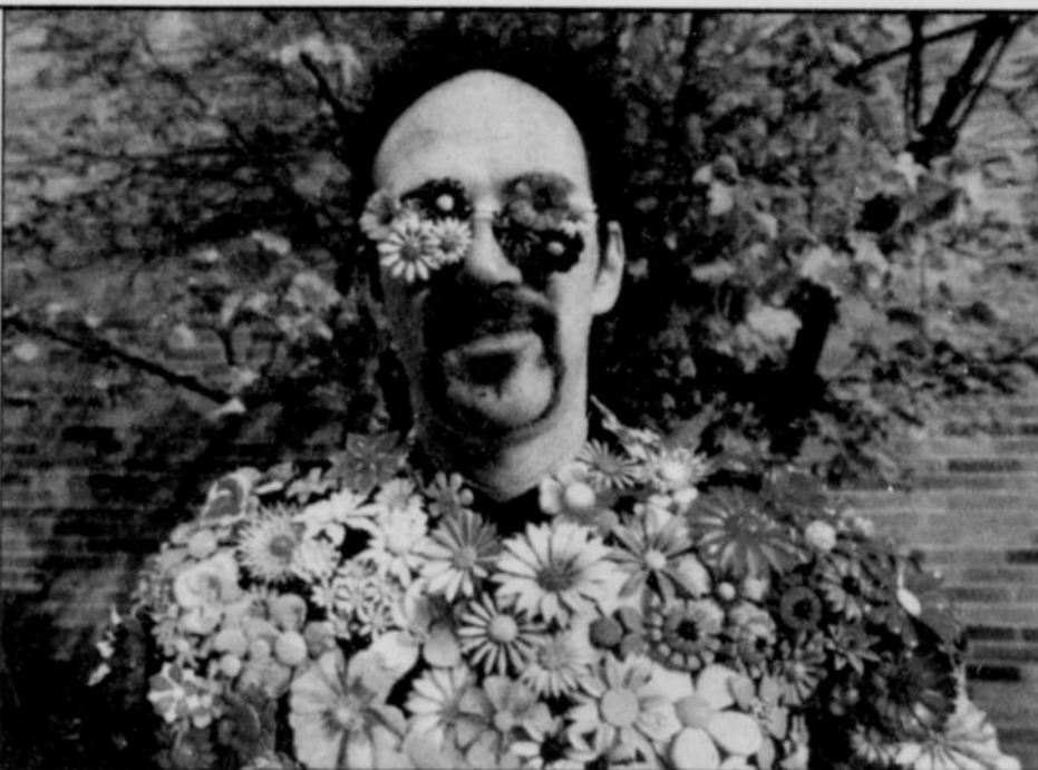
Chambers unveils photographer Alice Wheeler's The Influence of Flowers on a Melancholy Day Sept. 7.

For more information visit www.ccslaughterspdx.com .