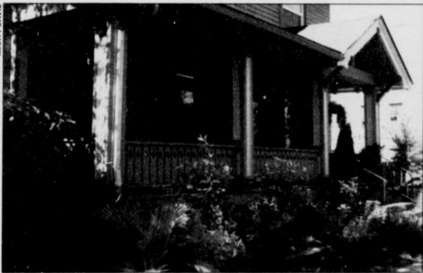
The Portland International Guesthouse offers gay-owned and hetero-friendly accommodations.