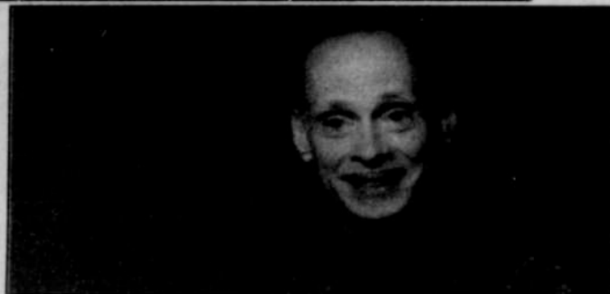
Ang Lee ( Brokeback Mountain ) and John Waters ( Pink Flamingos ) are two of the directors interviewed in Fabulous! The Story of Queer Cinema .