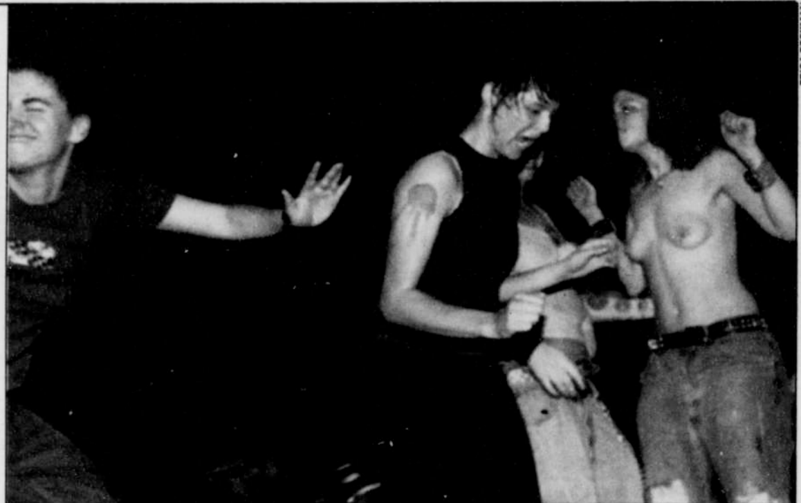
Queers get down during Homo a Go Go 2004 in Olympia, Wash. The biennial festival kicks off Aug. 1.

Portland Frontrunners take a 2.7- to 6.5-mile run along the Willamette River, followed by brunch. Meet at the