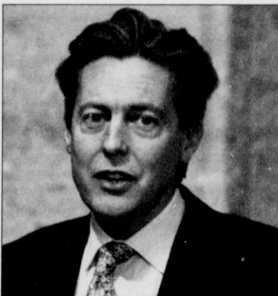
Member of Parliament Ben Bradshaw married his longtime partner, BBC journalist Neal Dalglish, June 24 in Exeter, England.