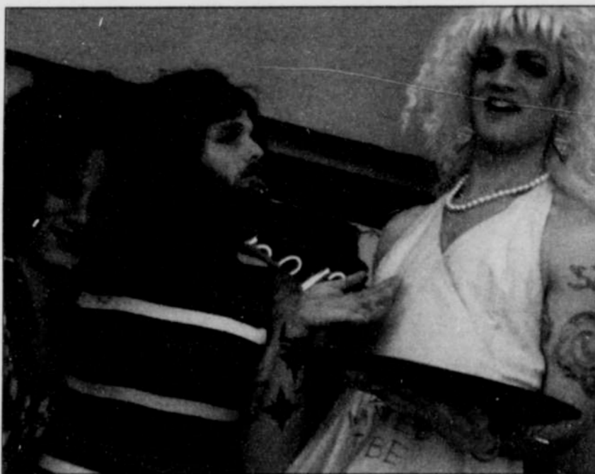
Yummy food, groovy DJs and servers in drag! Come to A.D.D.—Attention Deficit Drag every Wednesday at Cafe Wonder.

Lesbian-owned taco bar Dingo's presents Girls Night Out every Thursday. (7 pm. 4612 SE Hawthorne Blvd. 503-233-3996.)