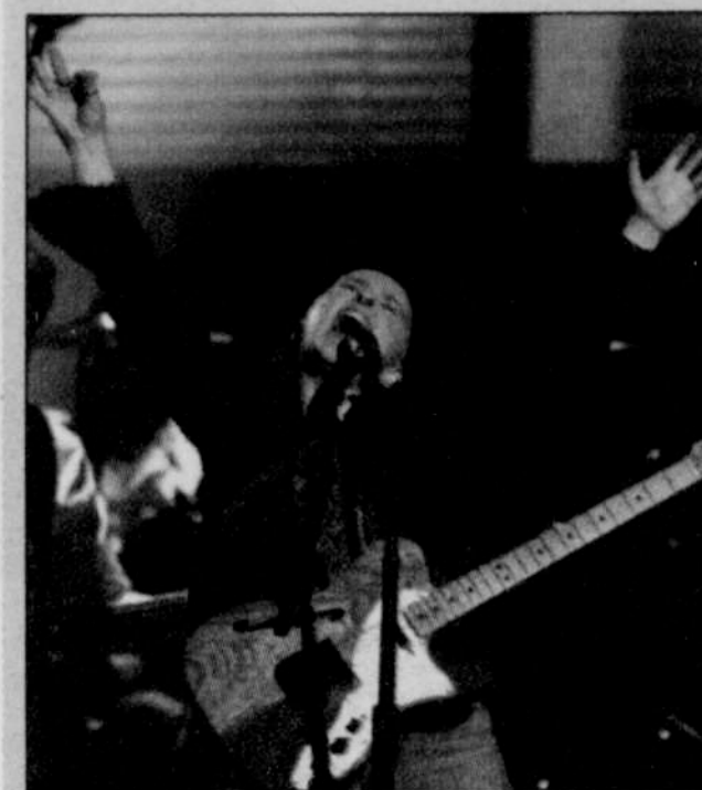
Melissa Etheridge rocked the house at the 2005 Grammy Awards.