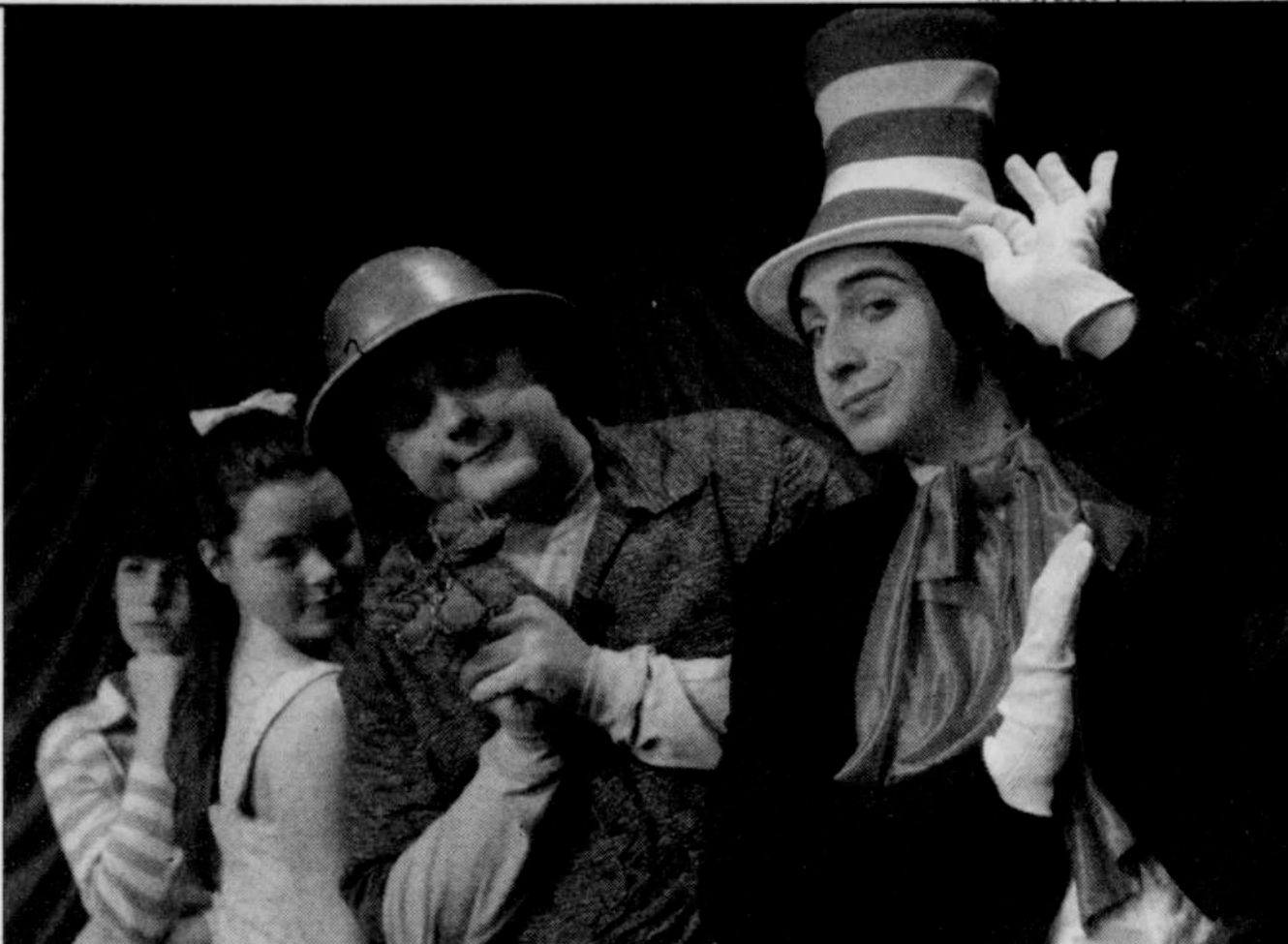
The Cat in the Hat is back in Seussical, the Musical through May 28 at Northwest Children's Theater.

Oregon Children's Theatre presents Alexander, Who's Not, Not, Not, Not, Not, Not Going to Move! —a musical chock full of pop, Motown and Broadway-inspired songs—through May 14 at Brunish Hall. Cute, but a bit of manic mug-fest, even for the third-grade set. Family audiences, however, will enjoy this low-tech musical (complete with its own, admittedly impressive boy band)—at least until rippling with fidgetiness at the downbeat of an inescapable denouement ballad. (11 am and 2 pm Saturday, 2 and 5 pm Sunday. 1111 SW Broadway. $17-$22 from 503-228-9571 or Ticketmaster.)