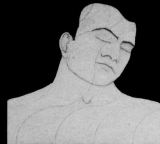
"currents" oil on wood jeffrey palladini

show runs may 1 thru 31 opening reception friday, may 5, 6 - 9pm