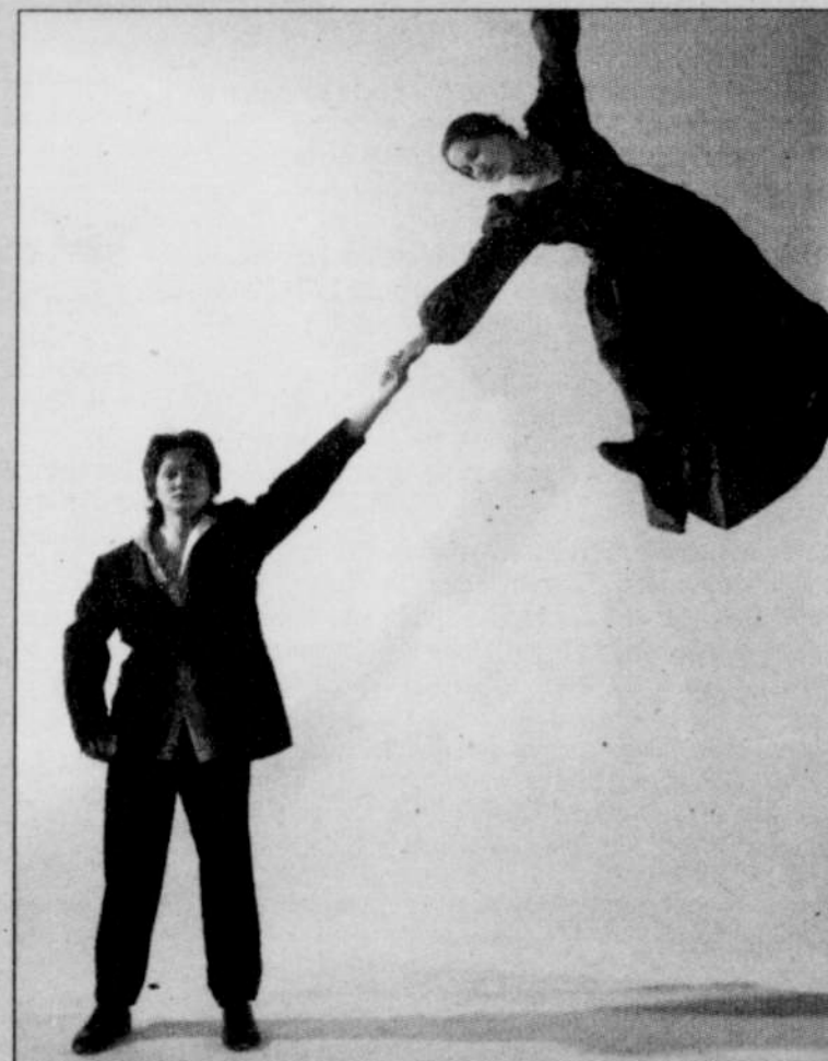
And Then.... is a new work by Do Jump! Extremely Physical Theater inspired by the paintings of Marc Chagall.