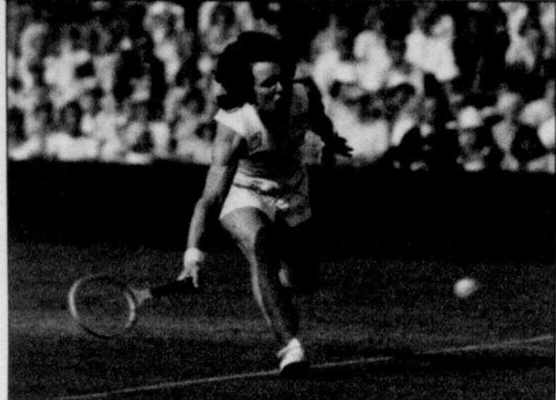
Billie Jean King: Portrait of a Pioneer airs April 26 on HBO.

Booty , an alterna-queer night held every Thursday at Porky's Pub, presents a special performance by the electronic/fashion/sex show Fleshtone. (9 pm. 835 N Lombard St. $3.)