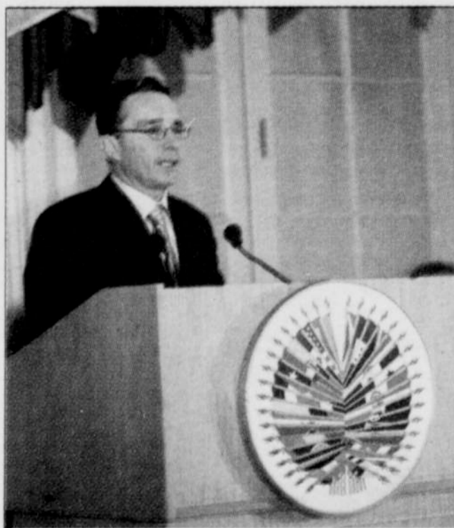
Colombian President Álvaro Uribe supports spousal rights for gay couples but not marriage.