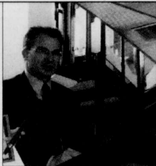
Australian Capital Territory Chief Minister Jon Stanhope says his government is "committed to equality."

A recent Gallup poll found that 77 percent of