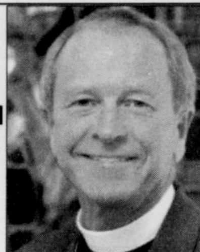
Gene Robinson, the Episcopal church's first openly gay bishop, is being threatened with a church trial.

The orphan group, known as Lay Episcopalians