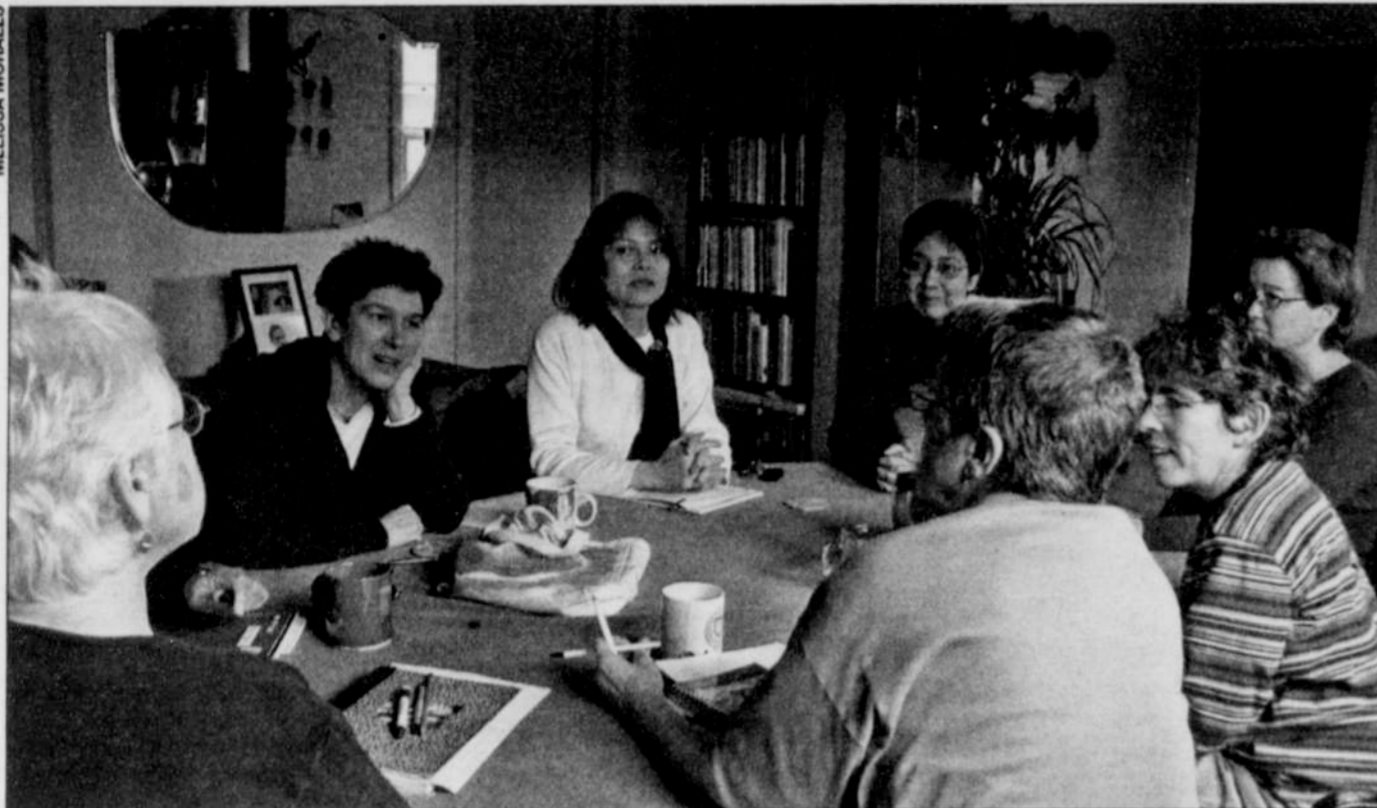
The 29th Street Writers have been writing, learning, supporting and critiquing each other's work for 20 years.