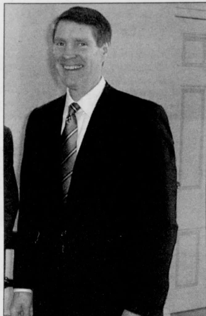
Senate Majority Leader Bill Frist announced his plans to vote in early June for the Marriage Protection Amendment, largely seen as a ploy to wedge voters in the midterm elections.

When the Senate last voted on the issue in July 2004, a procedural motion to consider the ban received 48 votes—well short of the number needed to send it on to the House of Representatives and then to all 50 states for ratification. At that time, six Republicans, including Sen. John McCain of Arizona, voted against the ban.