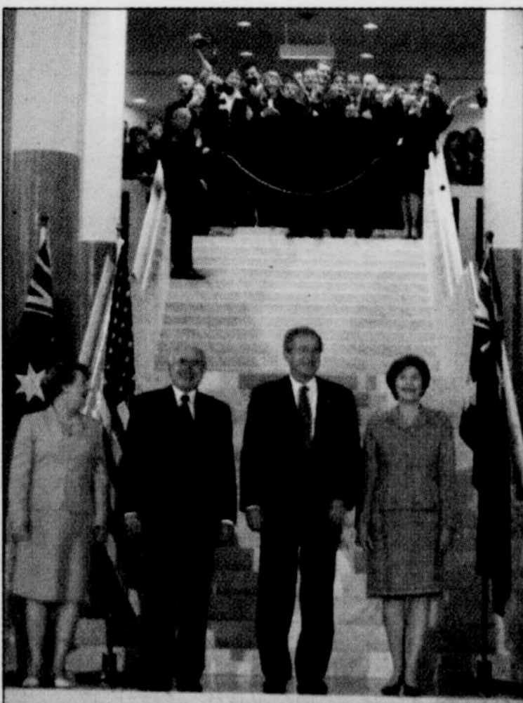
President Bush and Laura Bush stand with Australian Prime Minister John Howard and his wife, Jannette Howard, at the Parliament House in Canberra, Australia, Oct. 23, 2003. Howard opposes same-sex marriage as well as civil unions, which he calls a "cop-out."

The measure previously passed the Chamber of Deputies and now awaits a decision by President Vaclav Klaus, who has hinted he might veto it. The legislation extends to registered same-sex couples many of the rights and obligations of marriage but does not provide access to marriage itself or to adoption.