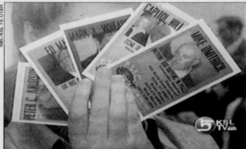
A youth displays legislative trading cards designed by members of the Gay Straight Alliance during a meeting at the Utah Capitol.