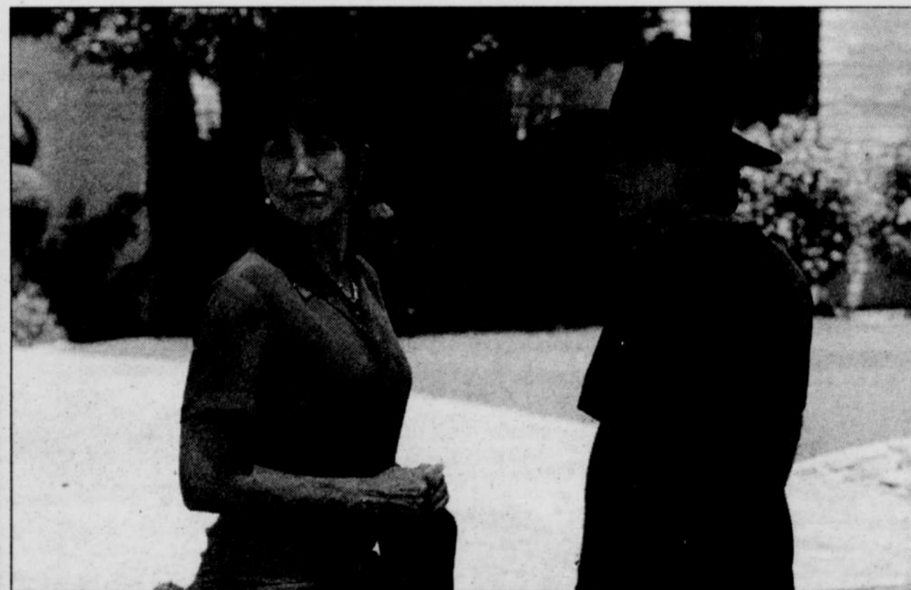
The film Transamerica and other popular media representations of trans people will be the subject of the Genderblendz open house Feb. 20 at Outside In's Trans/Identity Resource Centre.

Visit us online at: www.reyreece.com or schedule your appointment.