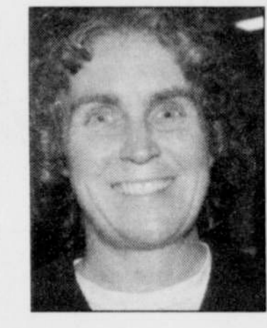
"I teach couples massage classes, so I usually spend it helping other people enjoy their mate.'