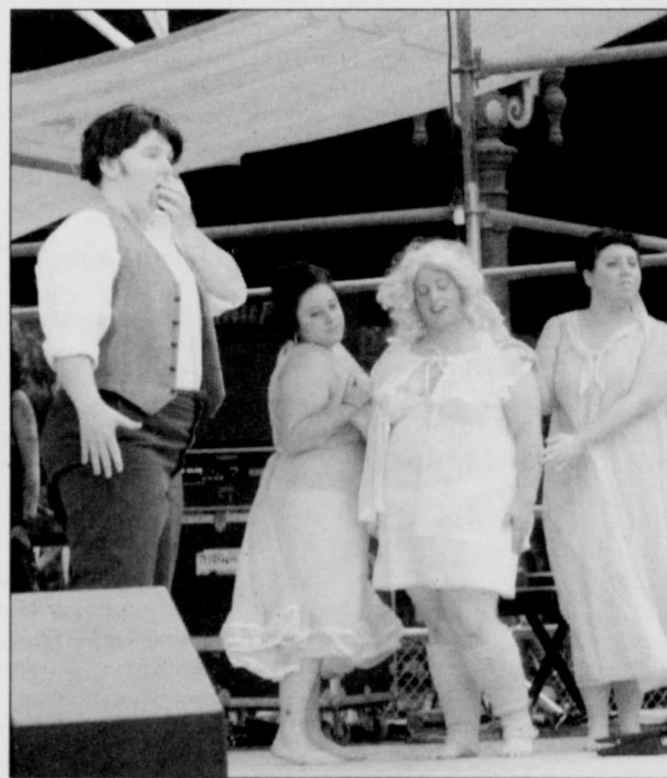
Mercury bloggers banter about the final performance of DK PDX.