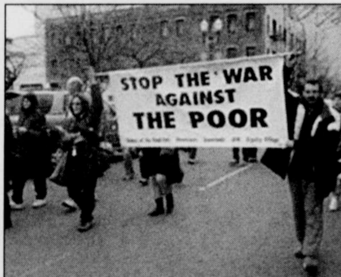
Activists rally for the Rev. Martin Luther King Jr. at the 2005 march by Sisters of the Road.