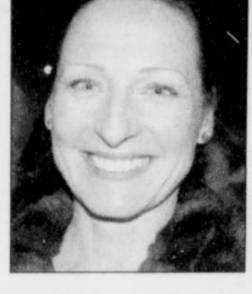
"I don't think I've ever followed through on a resolution. You should make decisions to change things in your life throughout the year instead of waiting for new year's."