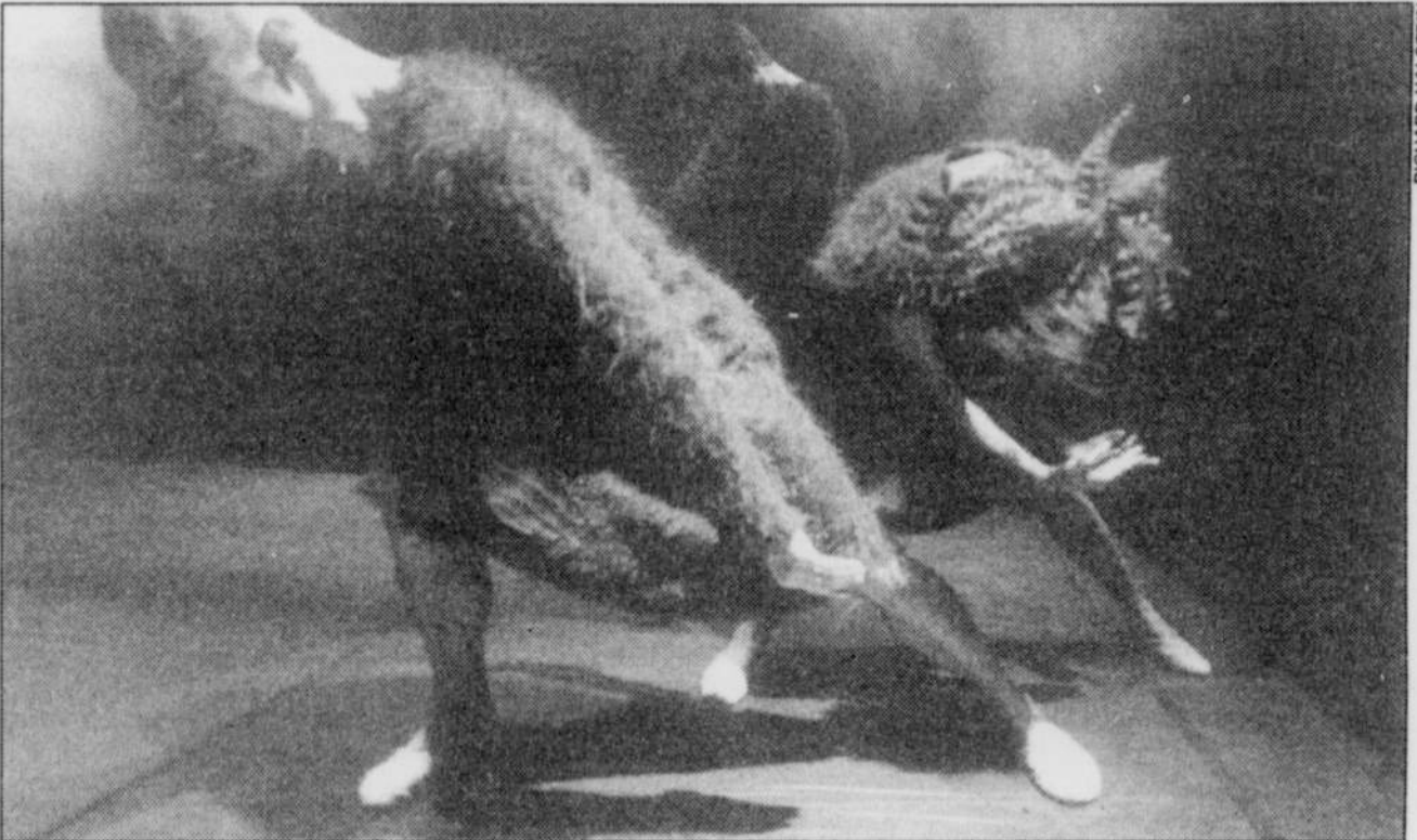
White Bird presents Emio Greco | PC, an internationally celebrated dance ensemble, Jan. 12-14.