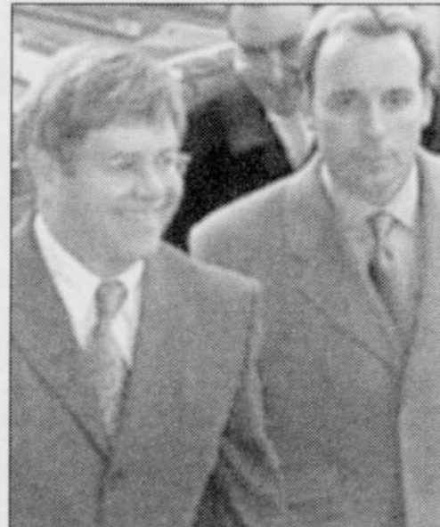
Singer Elton John and partner David Furnish tied the knot, along with about 700 other Britons, under the United Kingdom's Civil Partnership Act, which went into effect Dec. 19.

"It is, to my knowledge, the first time the government has released a figure of this sort, but it does come with caveats," a Department of Trade and Industry spokesman told the newspaper. "It is based on a number of studies by different interest groups, but fundamentally there is very little reliable information about the size of the lesbian, gay and bisexual group."