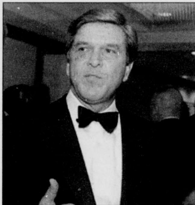
U.S. Sen. Gordon Smith, R-Ore., was awarded the Torchbearer Award for his advocacy for AIDS issues in Washington, D.C.