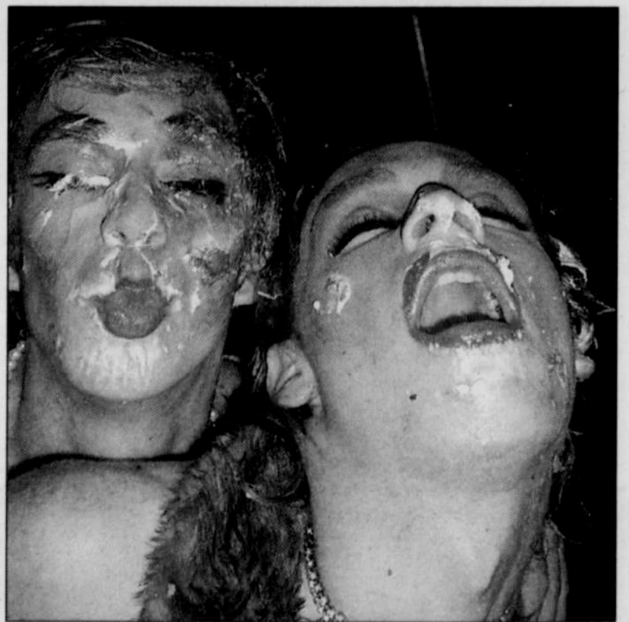
The dirty boys of Sissyboy always take it one step over the line.

Yet his own "normal" lifestyle may force the holy roller to face criminal charges for one of the three alleged attacks that still falls within Oregon's statute of limitations. Beres posted a statement on the Christian Coalition Web site denying any criminal conduct. [E]