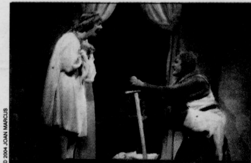
Hank Azaria (right, with Christian Borle) is initiated into gay life as a butchly swish Lancelot in Spamalot .

butchly swish Lancelot and, in a class of her own, Sara Ramirez's crackerjack timing and jaw-dropping voice in her justifiably Tony-winning turn as the Lady (or should we say Diva) of the Lake. By the time we reached the sing-along bows and the confetti cannons, the audience had reached a unique state of musical comedy delirium—how wonderful to see such happiness in a theater.