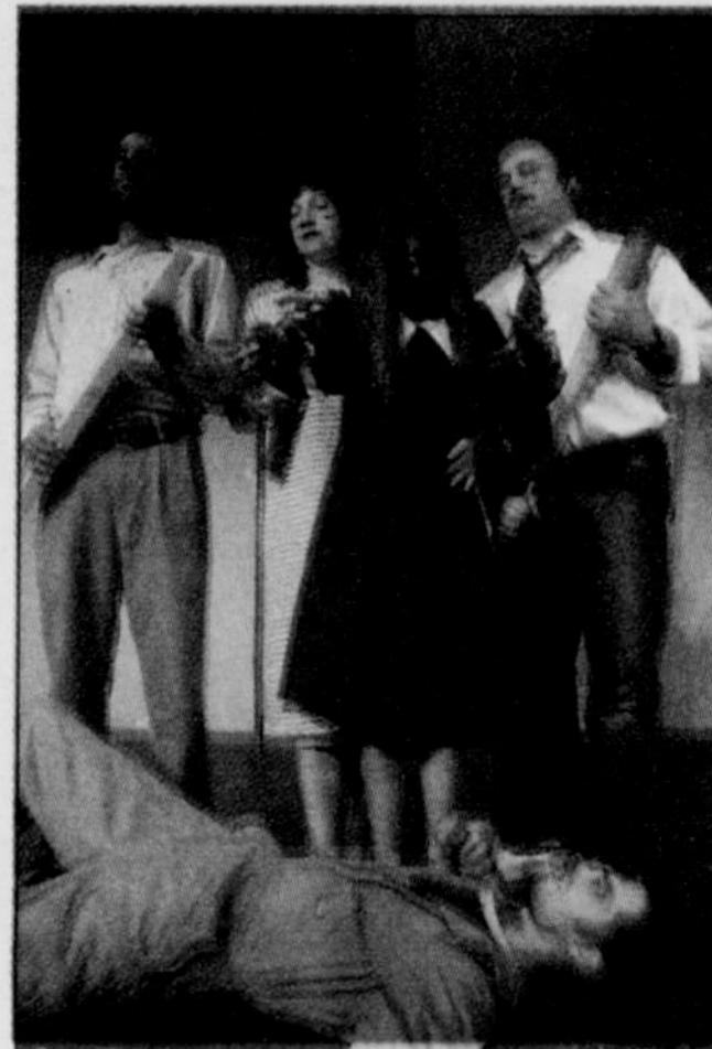
Northwest Children's Theater revives Night of the Living Dead through Oct. 29.