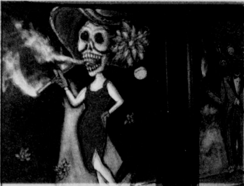
Artists deal with the intensity and continuity of death and life Oct. 27 at Onda Arte Latina.

Lesbian-owned Middle Eastern bar Zaytoon screens Stanley Kubrick's The Shining as part of its October Horror Festival. (9:30 pm, 2236 NE Alberta St.)