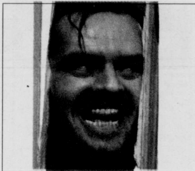
The Shining will scare the hell out of you Oct. 24 at Zaytoon.