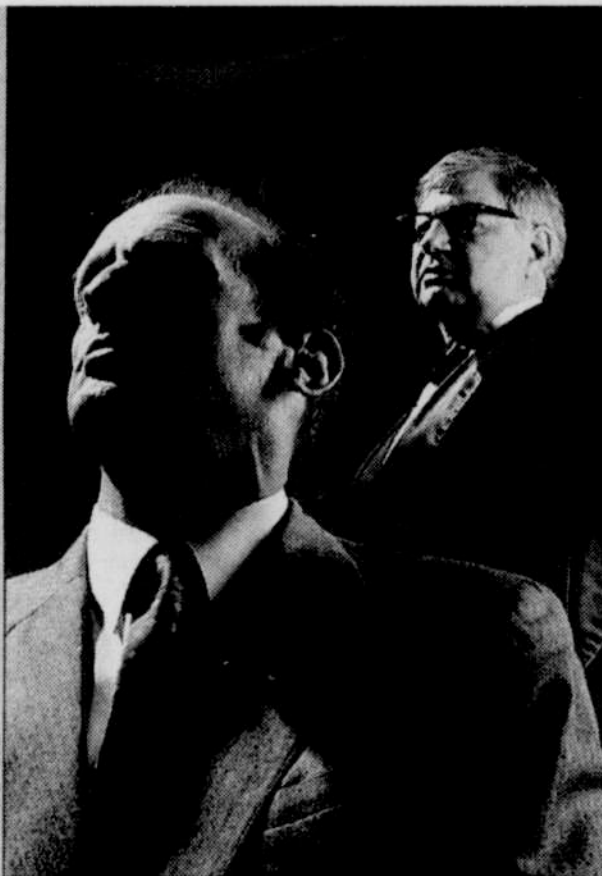
CoHo Productions presents Nixon's Nixon through Nov. 26.

Portland Leather Alliance is one of the largest pansexual, nonprofit B/D/S/M, leather and fetish lifestyle organizations in the Northwest. Regular social