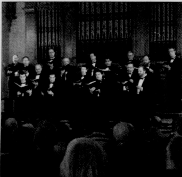
Express, the Portland Gay Men's Chorus chamber ensemble, performs a delightful afternoon of classical fare Oct. 23.

Portland Frontrunners take a 2.7- to 6.5-mile run along the Willamette River, followed by brunch. Meet at the intersection of Southeast Main Street and the Eastbank Esplanade. (9 am. www.portlandfrontrunners.org .)