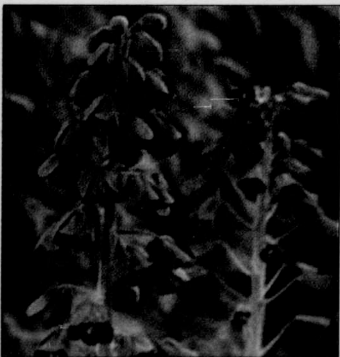
Checker Lily (left)—called "diapered" by Oscar Wilde—and Fritillaria persica should be planted now for a showy spring.