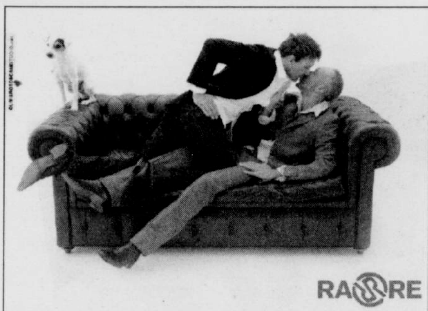
This ad campaign for Ra-Re clothing is causing controversy in Italy.