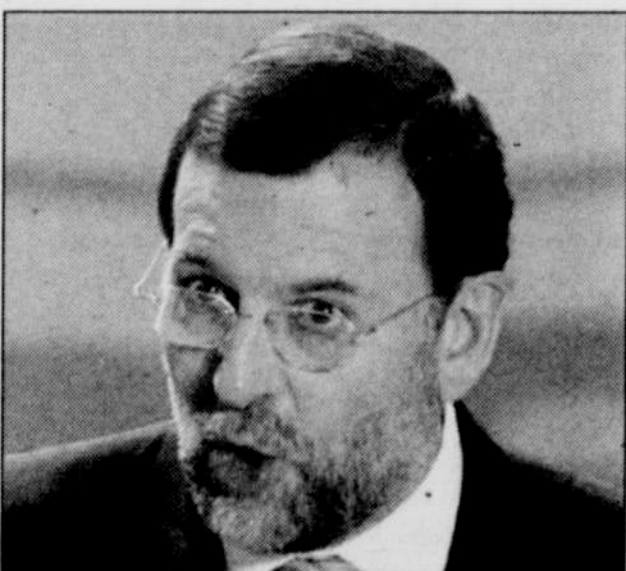
Spain's main opposition party leader, Mariano Rajoy, believes the Spanish Constitution prevents marriages between same-sex couples.

Full marriage also is available to same-sex couples in Belgium, Canada, the Netherlands and Massachusetts.