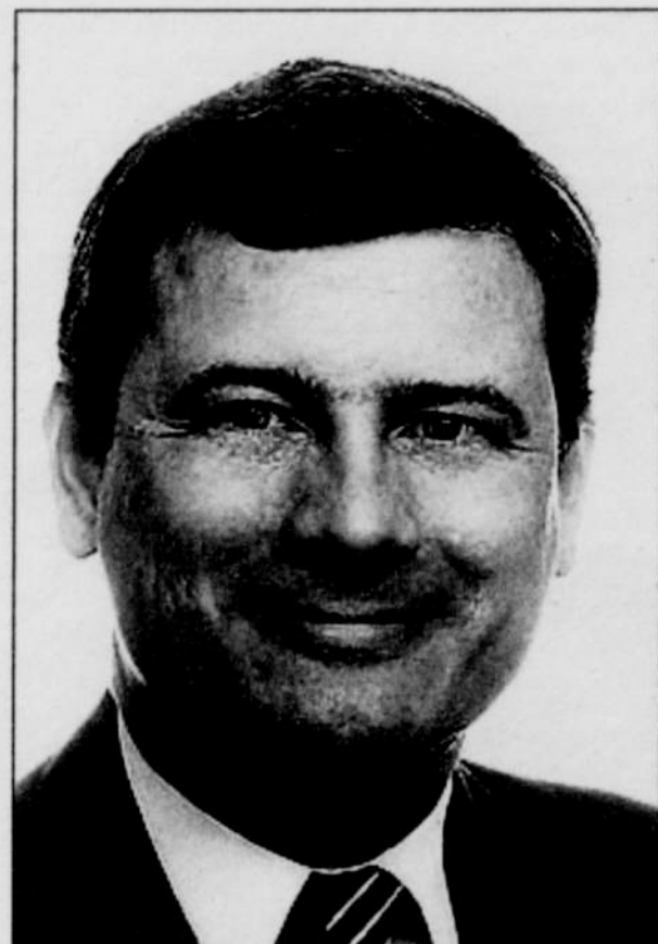
Supreme Court nominee John G. Roberts Jr. has demonstrated legal support for gays.