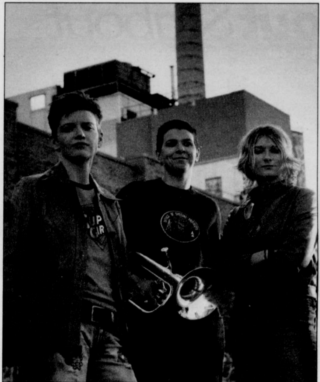
Aussie queers Fruit perform Aug. 17 at Mississippi Studios.

GO OUT Come to PGE Park for the first-ever Portland Beavers LGBT Night! (6 pm. 1844 SW Morrison St. $5.50.)