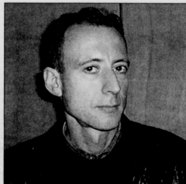
Peter Tatchell of OutRage feels threatened by Muslim fundamentalists.

The threats began after OutRage stepped up its campaign in defense of gay Muslims fleeing attempted "honor killings" in Algeria, Iran, Palestine and the United Kingdom. Police identified the phone number from which the threats came, but it was a prepay mobile phone that could not be traced.