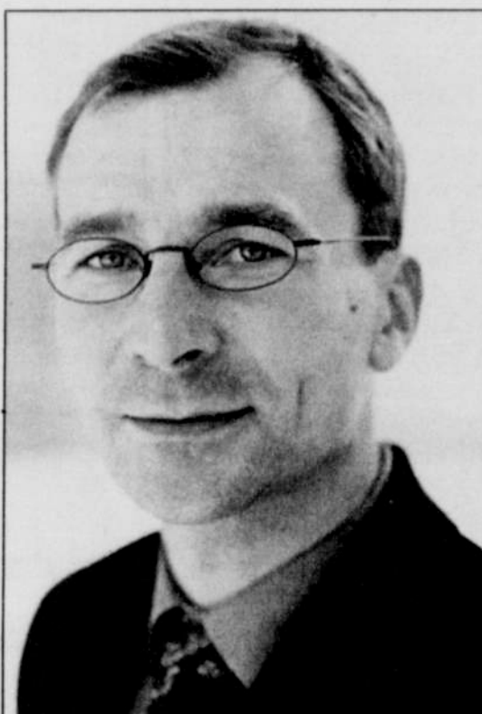
Volker Beck, a gay member of Parliament, compared lists kept by German police to "pink lists" of Nazi Germany.