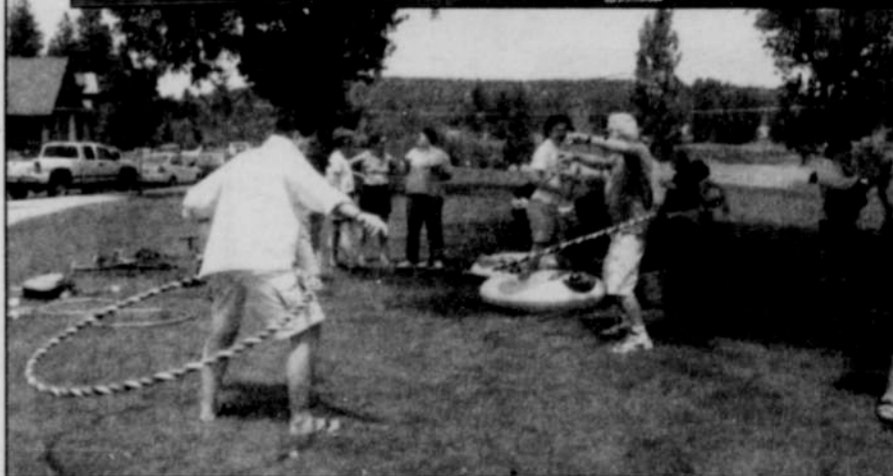
Central Oregonians at the first-ever Pride celebration in Bend (above and right) spent the day eating, hacky-sacking, hula-hooping and rafting.