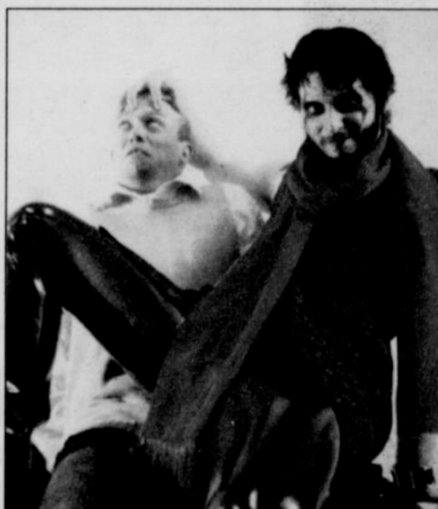
Stark Raving Theatre revisits Joseph Fisher's contemporary version of a classic dilemma in Faust. Us. (Version 2.0) July 8-Aug. 6.

Queer DJ Tool spins during late-night happy hour Thursdays through Saturdays at Green