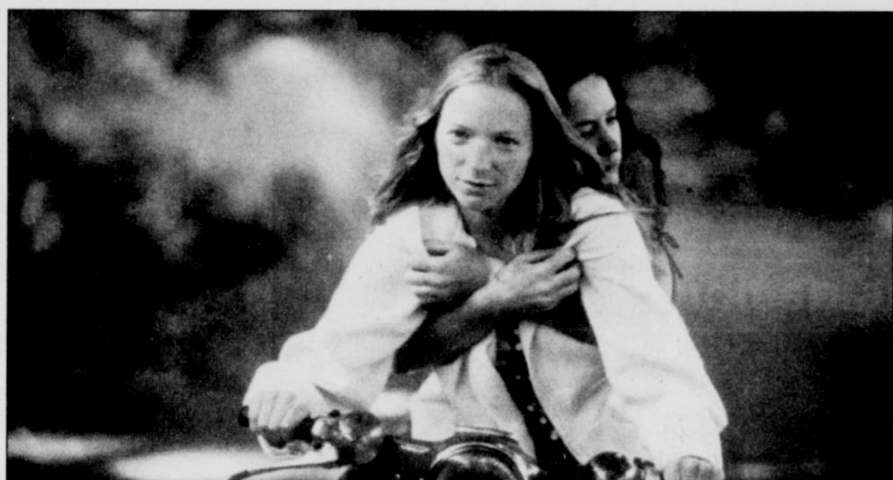
Nathalie Press (left) spends My Summer of Love with Emily Blunt.

trying on each other's clothes and passing out. The pansexual Tamsin is manipulative and beguiling, and Mona, who recently suffered a humiliating breakup with a married man, is quietly desperate for the attention Tamsin lavishes on her.