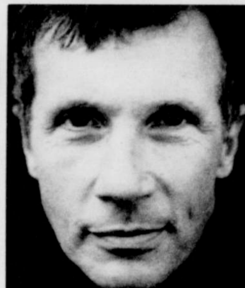
Michael Cunningham reads from Specimen Days , his first novel since The Hours , June 21 at Powell's.