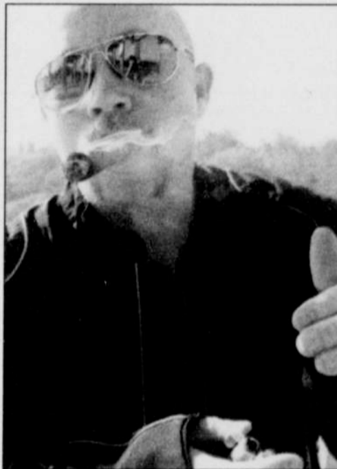
Female-to-male porn star Buck Angel comes to town June 24 and 25.

Hey, what's your vice? Find out during Double Down , a monthly queer night at Holocene. Place your bets on this event to be the hottest party Portland has seen yet. (8 pm. 1001 SE Morrison St. $5.)