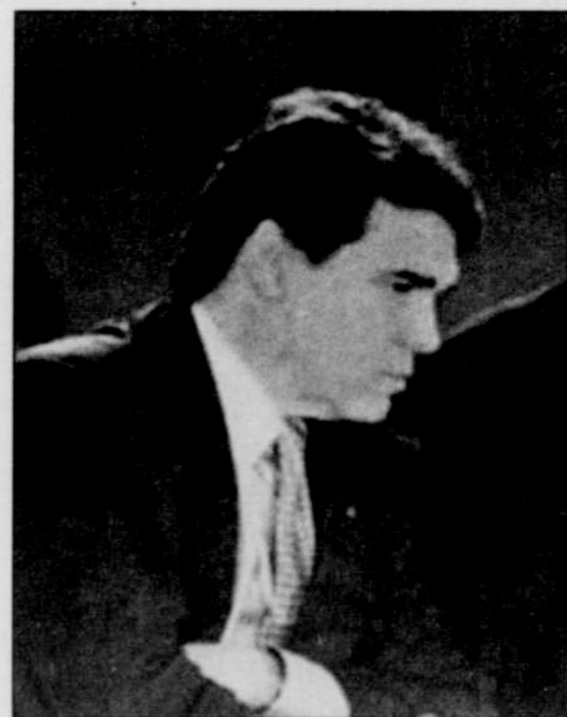
Texas Gov. Rick Perry tells gay vets to scram if they don't like his opinions.