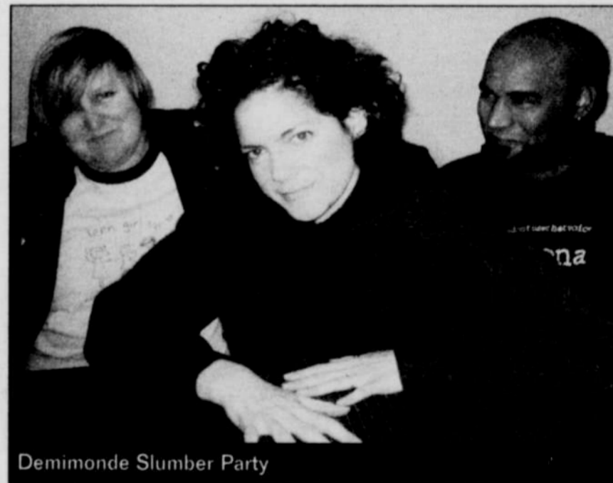
Demimonde Slumber Party