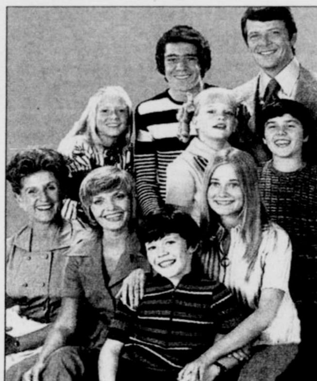
Gay actor Robert Reed portrayed the man of the house in The Brady Bunch .