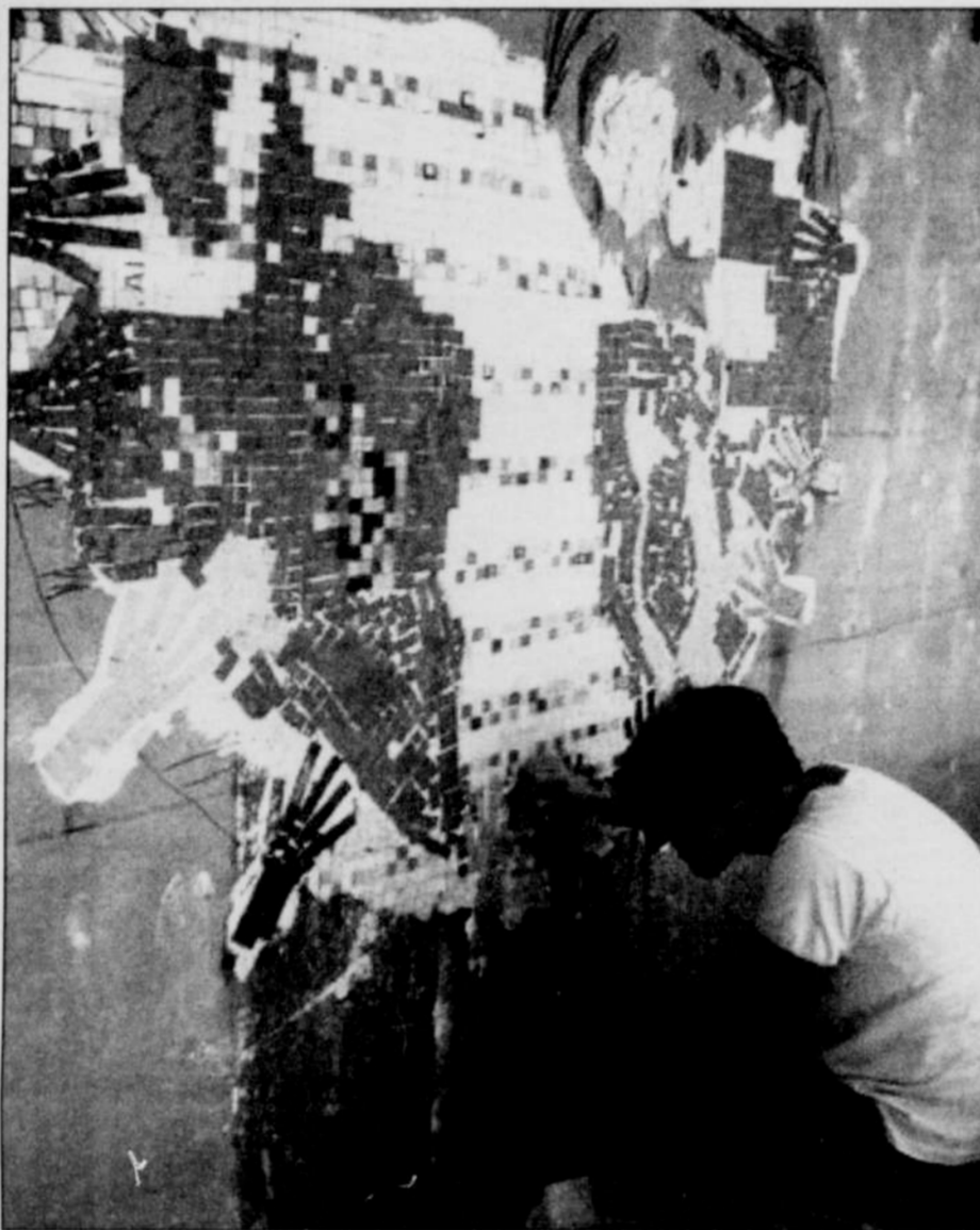
Madison High's Gay Straight Alliance will complete its mosaic project by the end of the school year.

Students from the school's Gay Straight Alliance have been creating unique mosaic panels to compose a mural on the theme of social justice. Central to the design is a globe with Mahatma Gandhi's famous mantra, "Be the Change."