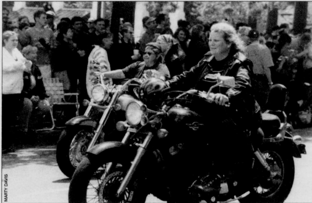
In a change from past years, Dykes on Bikes must preregister with Pride Northwest.