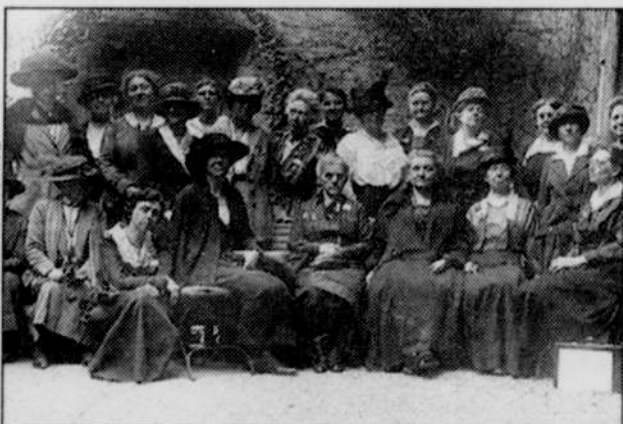
Women gather in Zurich in 1916 for the second meeting of the Women's International League for Peace and Freedom.