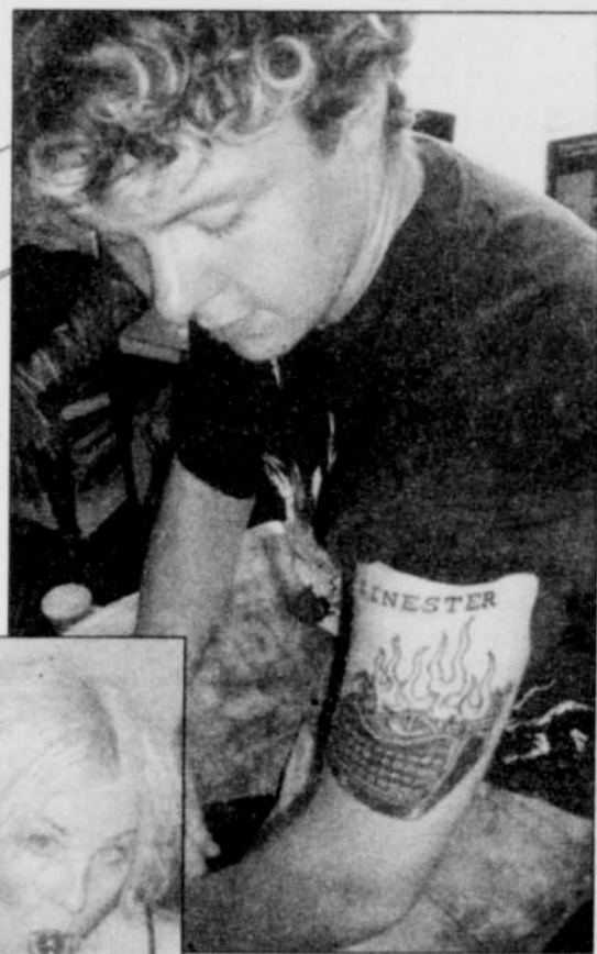
I Do: Family Lessons to Unlearn , is about his experience bringing a trans partner home to meet his family for Thanksgiving—before he came out himself.

He also helped open the Denver Zine Library.