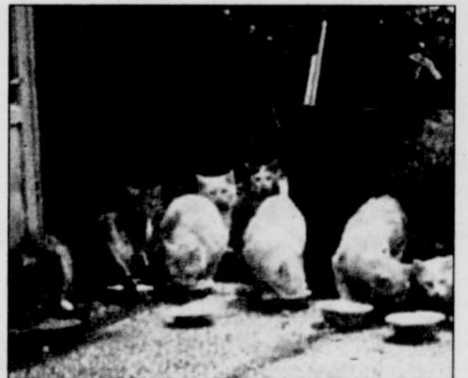
Feral cats chow down thanks to their benefactors at the Furball.

The Furball is black-tie optional and will feature a martini bar, catering by Elephants Delicatessen, silent and live auctions, and raffles. Live auction items include accommodations at a private villa in Cabo San Lucas, Mexico, and a spectacular three-bedroom condo in Puerto Rico; original art from Portlanders; a VIP package for the historic races; a monthly dining-out package; wine tasting parties; shopping sprees; jewelry; and cat-themed items. A raffle drawing for a $1,500 prepaid Visa card rounds out the evening. This year's theme is "Feline Groovy," and the honorary chairman is City Commissioner Sam Adams.