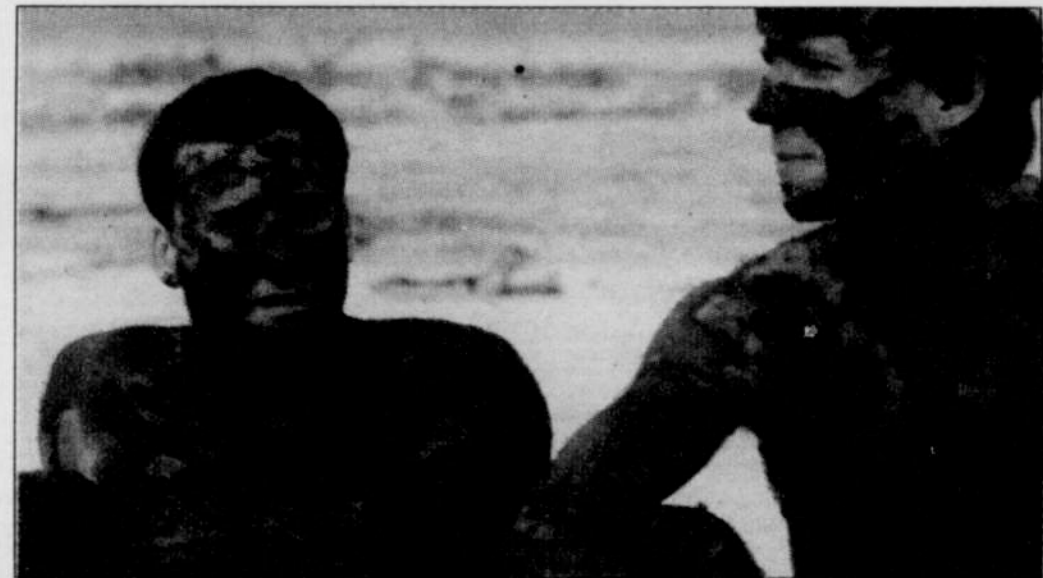
If you missed it at last year's queer film fest, Walk on Water screens again Jan. 27 as part of the Northwest Film Center's 13th annual Jewish Film Festival

Holocene for a night of profane/sacred homoerotic pop music. Also performing are Portland electro-pop duo The Blow and San Francisco future-proggers Crime in Choir . (8 pm. 1001 SE Morrison St. $8 at the door, $7 in advance from Holocene, Ozone Records, Jackpot Records or BrownPaperTickets.com.)