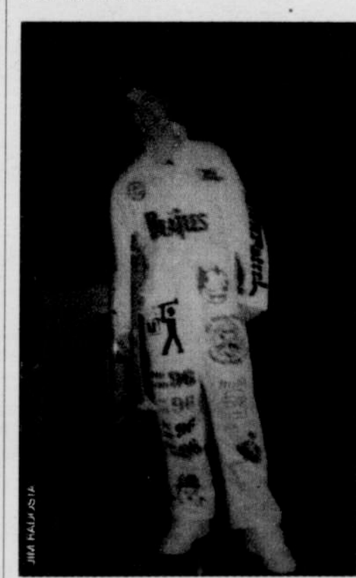
Sit back and let the evening go as Sneakin' Out and the Billy Shears Orchestra perform The Beatles' Sgt. Pepper's Lonely Hearts Club Band Jan. 26 and 28 at Mississippi Studios

Acoustic dyke duo Terra perform at Touchstone Coffee House. (7-9 pm. 7631 NE Glisan St.)